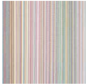
Order sample of colour nr. 0100