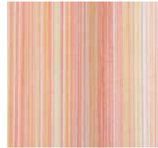
Order sample of colour nr. 0014