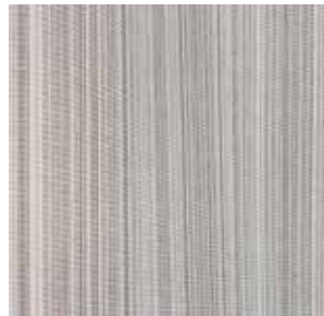
Order sample of colour nr. 0009