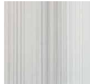
Order sample of colour nr. 0005